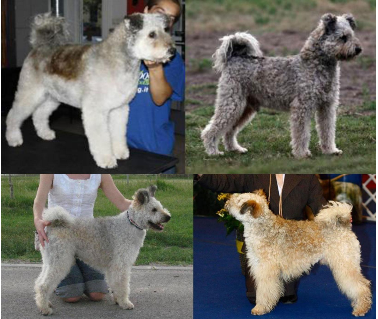
On the first photo is a dog with a coat adjusted for a show, while the second photo shows the same dog with the original coat per the standard.